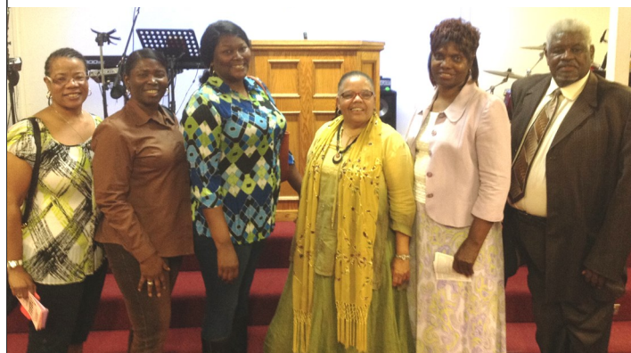
Representatives from Greater Height Mission Bible Church